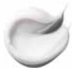
Silk amino acids